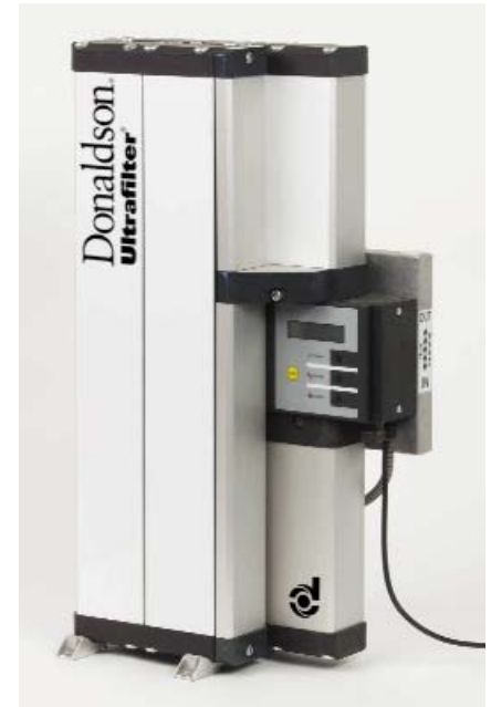
Medipac 2000 superplus

Breathing air systems including adsorption dryer, CO, CO 2 , NO x and SO 2 removal, pre-, afterfilter and condensate drain.