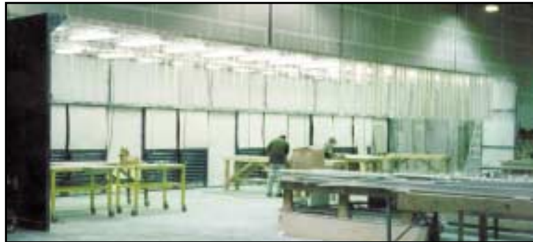
Environmental Control Booth

Donaldson's ECB works by creating a self-contained working environment complete with lighting, sound proofing and built-in dust collection. Workers inside the booth enjoy complete freedom of movement, cleaner air and excellent visibility. Using Ultra-Web filter media with our proprietary nanofiber technology, the powerful filtration capabilities of ECB prevents migration of dust to other parts of the plant, protecting workers outside the booth from the dust and noise generated inside the booth.