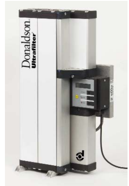
Medipac 2000 superplus

The final particle filter removes all particles which might be carried over from the adsorption and/ or catalyst stages.